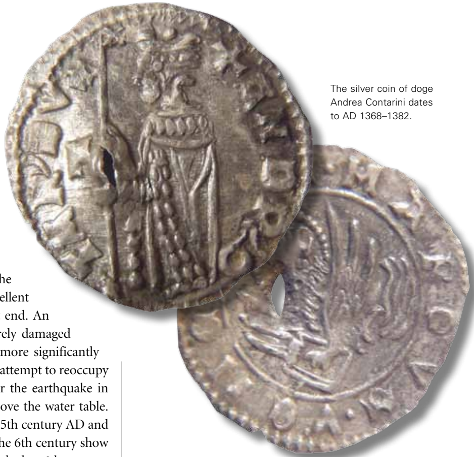
The silver coin of doge Andrea Contarini dates to AD 1368–1382.