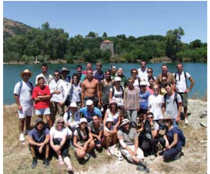
Members of the 2011 Summer School excavated at Butrint.

This landscape was reclaimed and transformed into plots of land by Roman land surveyors, who also built a half-mile long bridge connecting this area to the town; beside the bridge, an aqueduct took sweet water from a distant spring into the city. By AD 150 the settlement and streets gradually coalesced into a series of large townhouses, villas, and monumental cemeteries along the water frontage.