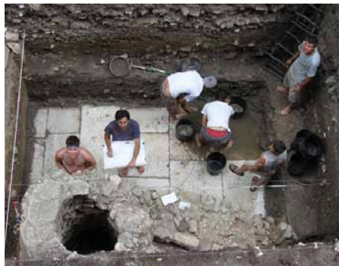
Above, students clean the forum pavement and record the well dating to the 6th century AD. Left, the Medieval house (left) and Late Antique public building (right) are located above the forum pavement in Trench 16.

Funded by the University of Notre Dame and the American Philosophical Society, the excavations are redefining the urban history of Butrint. Unlike Pompeii in Italy, where sterile volcanic deposits rest directly above the ruins of the Roman city of AD 79, the ancient urban center of Butrint is buried deep beneath a multitude of deposits rich in cultural material, the remnants of thousands of years of human settlement. Excavation trenches, dug as deep as 5 m (about 16 ft), allowed us to peer, as if through a window, into the city's historical transformation from the 5th century BC to modern times. The sequence of buildings and the sections of earth running from the bottom to the top of the trench tell a story of human and environmental actions which have buried the ancient city in tens of thousands of tons of earth and debris. The sheer quantity and array of material evidence generated by the excava-