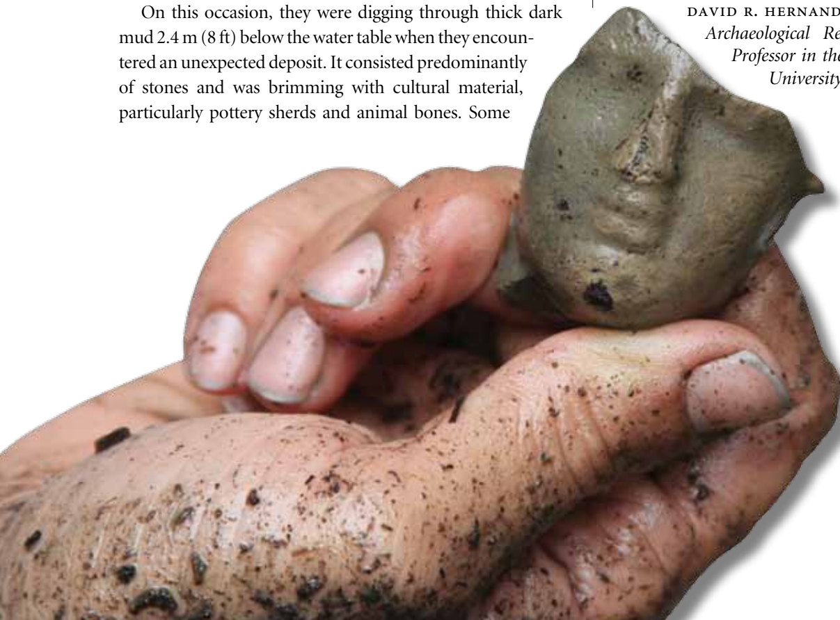
The face of a goddess figurine, discovered on the last day of excavation, dates to the 4th century BC.