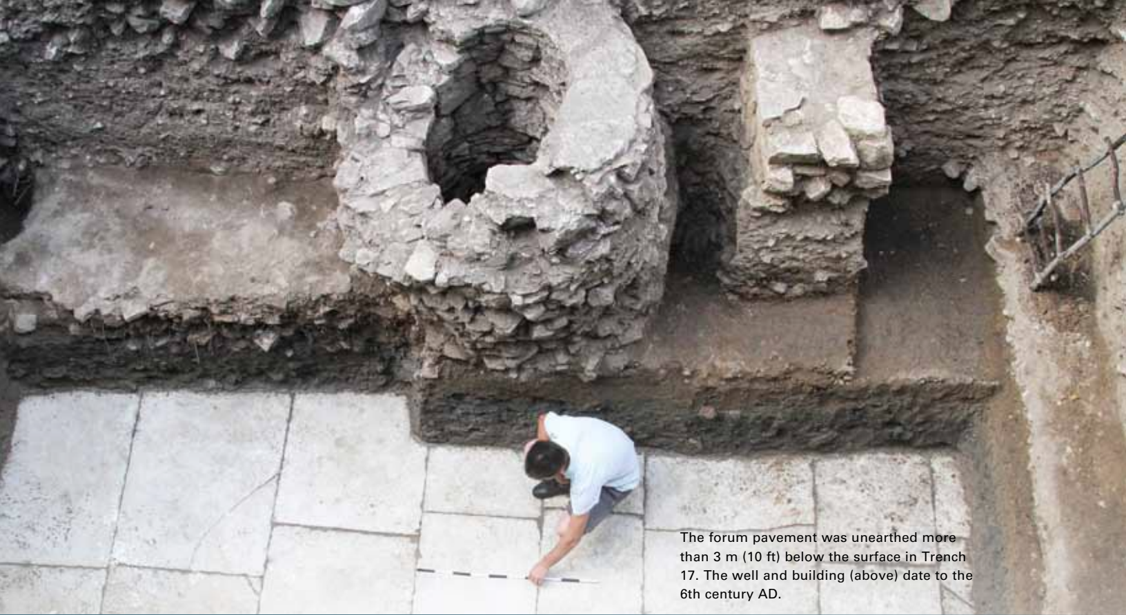
The forum pavement was unearthed more than 3 m (10 ft) below the surface in Trench 17. The well and building (above) date to the 6th century AD.