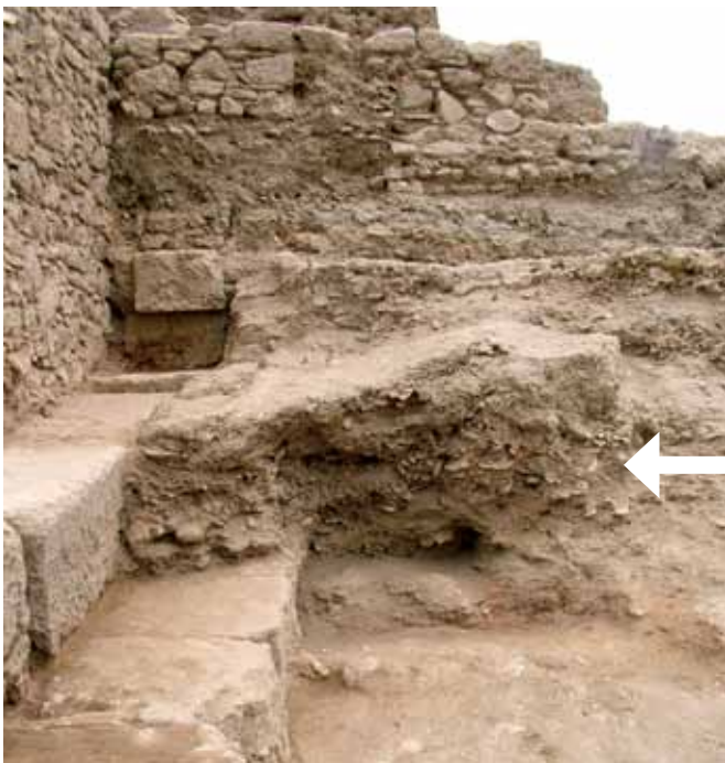
Bones are visible during the excavation of the southwest corner of West Hall. Cattle bones and sheep/goat horns were prevalent in the deposit.