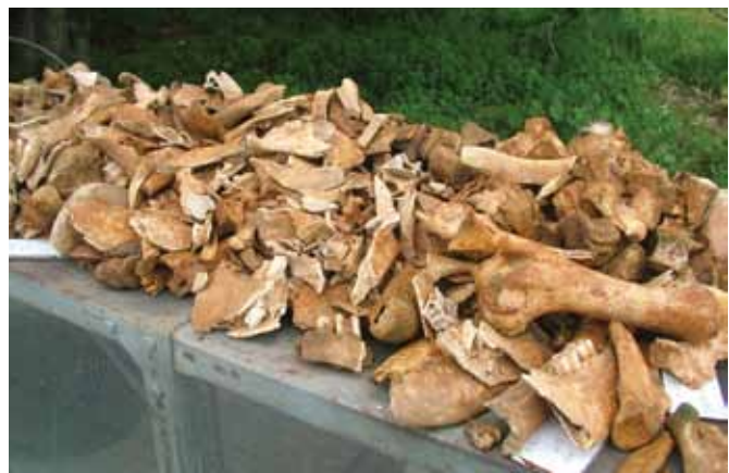
Over one ton of animal bones were found in 2011. Here, the washed bones are laid out to dry before preliminary examination.

Williams II, C.K. "Corinth, 1985, East of the Theater." Hesperia 55 (1986): 134-138.