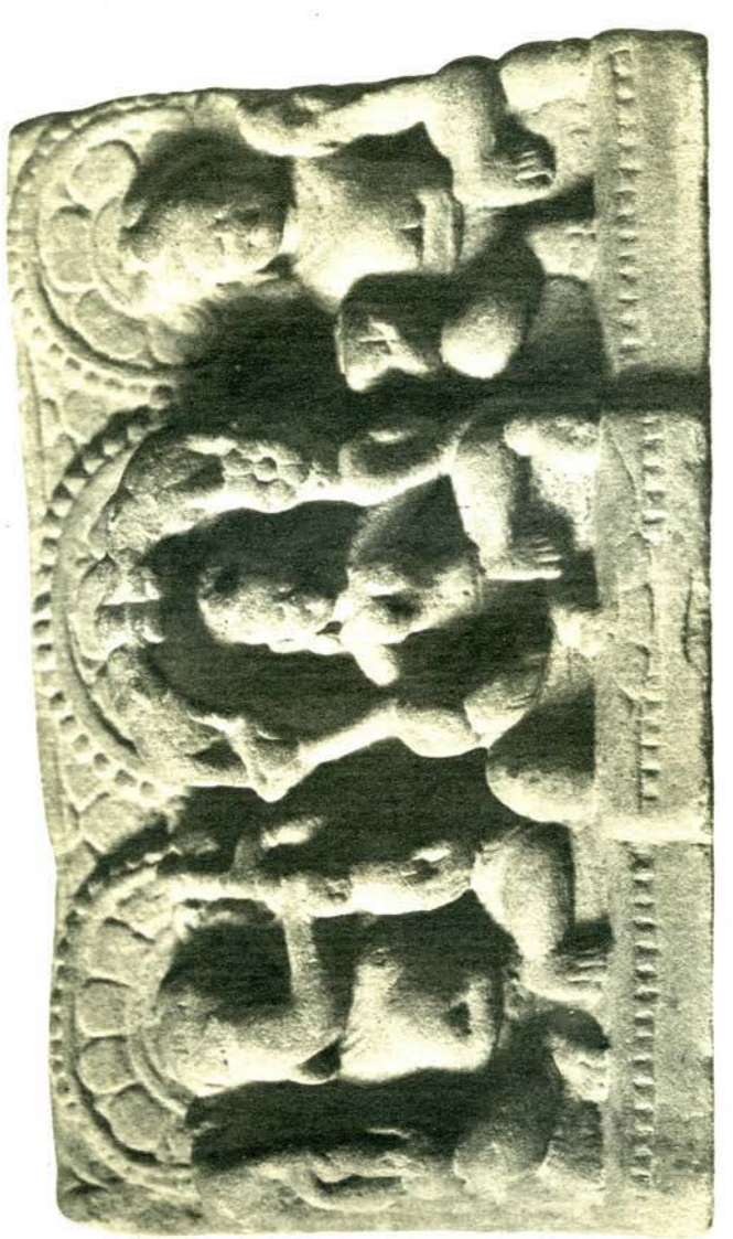
A TRINITY OF FORTUNE. NOW IN THE BOSTON MUSEUM OF FINE ARTS