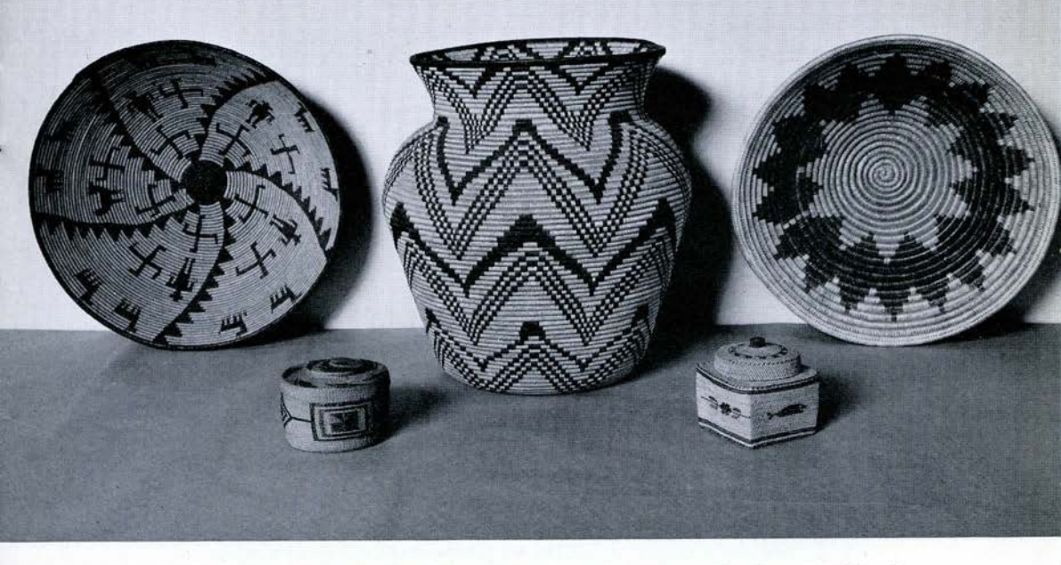
PLATE VII. Above. White Mountain Apache bowl and jar. Navaho sacred bowl. Tlingit and Makah trinket baskets.

Below. White Mountain Apache boat-shaped bowl.