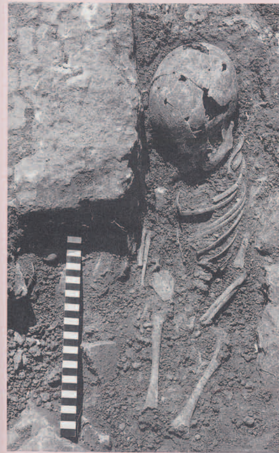
Figure 3. Skeletal remains of the child found trapped in earthquake debris in a cleft in the retaining wall (T20) separating the Lower from the Middle Sanctuary.