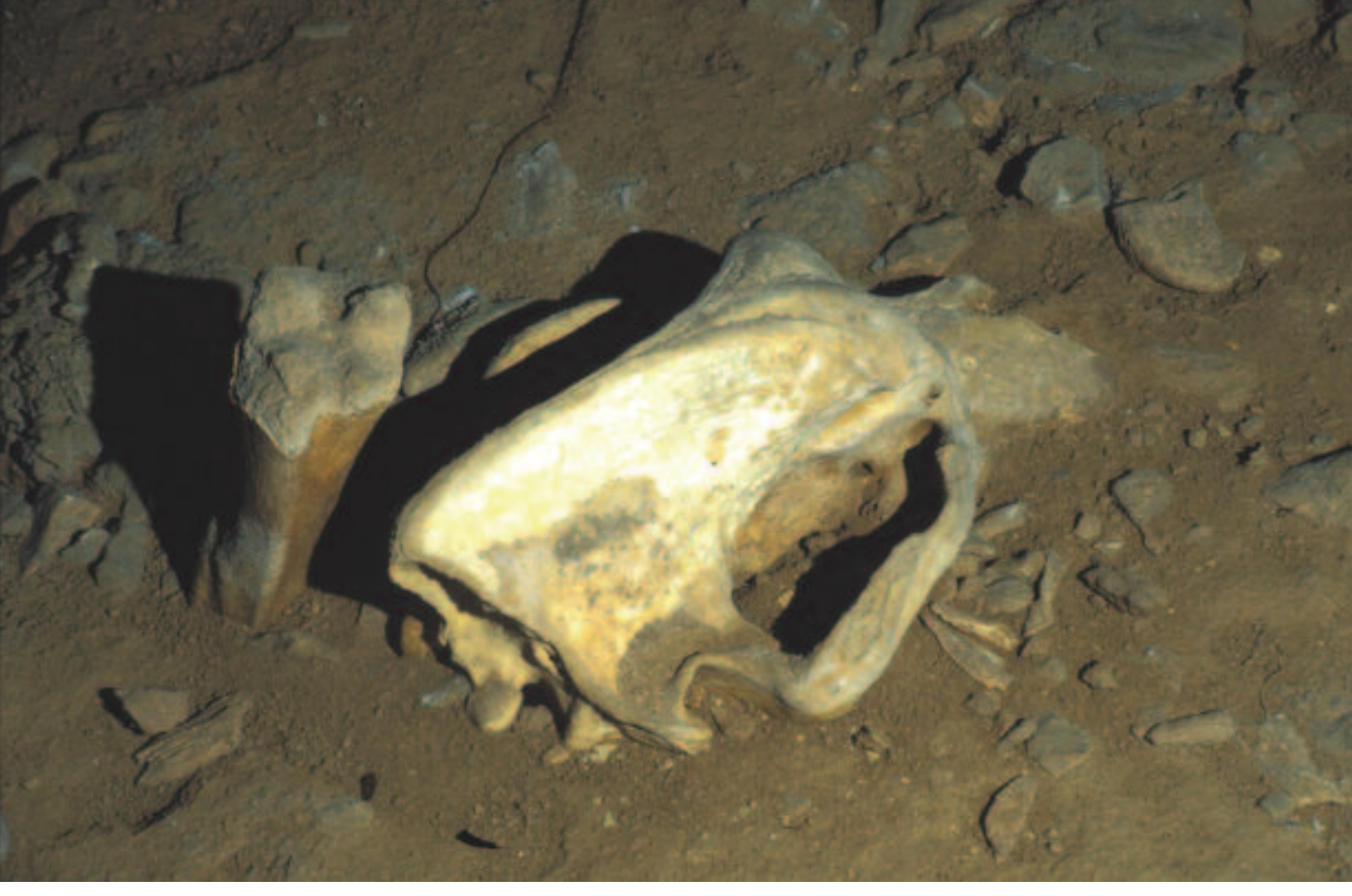
A cave bear humerus in Chauvet Cave (Vallon-Pont-d'Arc, France) was stuck halfway into the ground next to a cave bear skull. Another one was stuck in the same way about 10 m away.

People of the Upper Paleolithic consistently used the topography and unique wall surfaces of caves in their art throughout the entire period. They concentrated images around shafts in several caverns. In Niaux, France, most of the images were located at the end of a deep gallery in a place where the voice resounds in a most impressive way. A number of examples of animals are painted or engraved on walls as though they were issuing from or disappearing into recesses. The cave as a place crawling with spirits in animal form, literally at hand, ready to emerge from the walls, is also apparent in the use of natural relief surfaces in the rock. People seem to have believed that animal spirits were there inside the walls, half ready to come out. Perhaps painting the missing outlines to complete them aided humans in accessing the spiritual power of the animals.