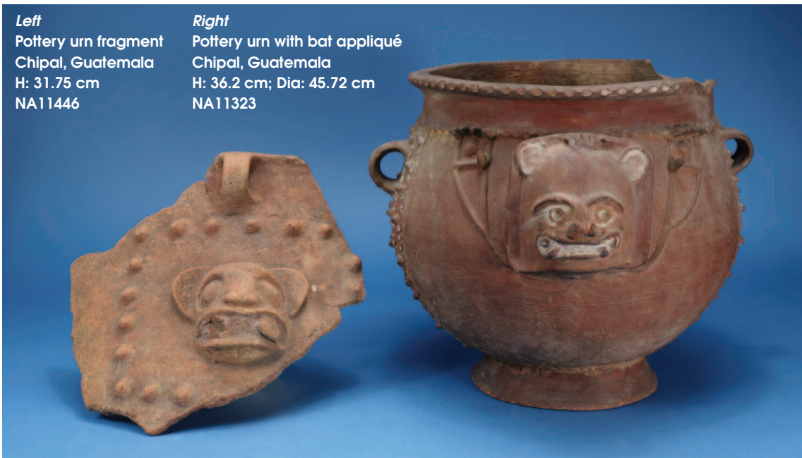
Left Pottery urn fragment Chipal, Guatemala H: 31.75 cm NA11446

The urn, decorated with a bat hanging by outstretched wings, was found buried under a block of stone and perhaps originally contained an offering to the powerful Earth Lord. The bat head on the large urn fragment is surrounded with spikes, a symbol of the ceiba tree, which has such spikes when young. Bats, inhabitants of caves, the openings to the Underworld, are frequently portrayed as supernatural beings, an appropriate symbol for offerings and burials.