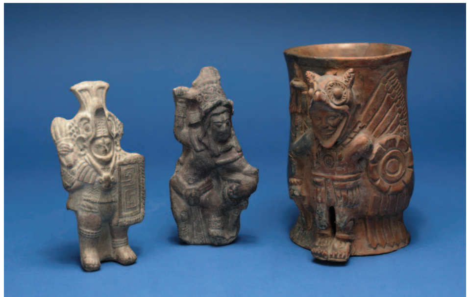
Left Plumbate ware cup with warrior effigy Chipal, Guatemala H: 18.2 cm; D of cup: 12.3 cm NA11531