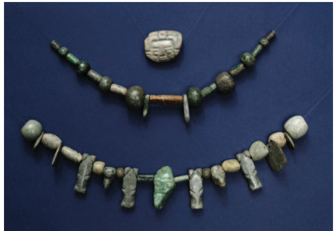
Top Jade carving Chipal, Guatemala H: 2.54 cm; W: 4.76 cm NA11480