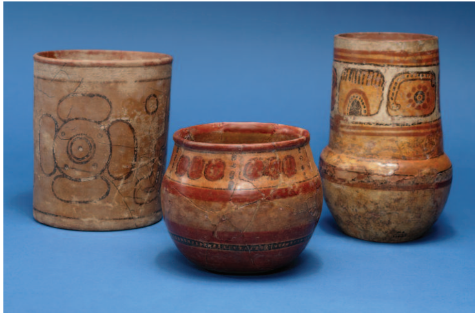
Left Pottery cylinder, with slip and paint Chama, Guatemala H: 18 cm; D: 15 cm NA11068

Although texts are rare in the highlands, individual glyphs or pseudo-glyphs, such as those on two of the vessels in the photograph, were common decorative motifs on the pottery of the region during the Late Classic (600–800 CE). The large graphic element on the cylinder may be the syllable b'i enclosed within blank affixes that, if completed, might have given the glyph a lexical meaning.