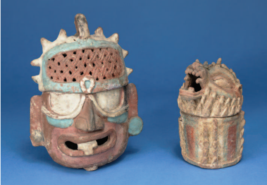
Left Pottery censer: deity, with red, white, and blue paint Sepacuite Valley, Guatemala H: 22.23 cm; W: 17.15 cm; D: 14.6 cm 37-12-44a, b