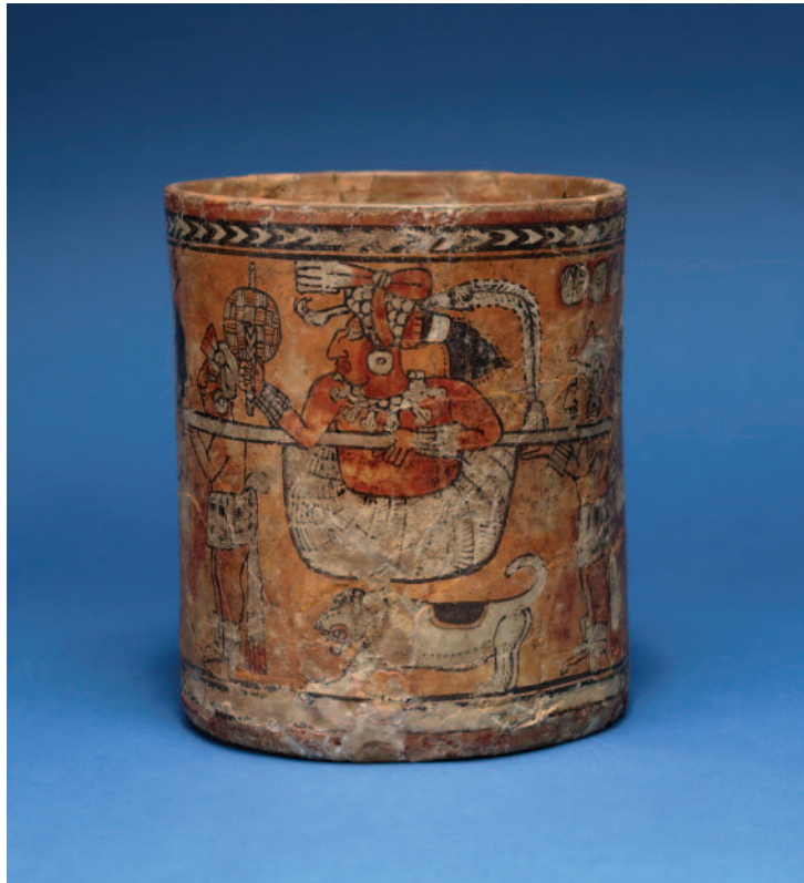
Chama polychrome cylinder Ratinlixul, Guatemala H: 21.2 cm; D: 18.5 cm NA11701 Rollout painting by M. Louise Baker

The three day-name glyphs to the right of the elite figure indicate that he is on a three-day journey. His jaguar skin-covered mat, royal seat of the ruler, is carried by the retainer immediately behind him, while the dog to be ritually sacrificed walks beneath the litter. At least five other vessels are known to echo this scene, suggesting the importance of the occasion and the desire to proclaim it widely: a pictorial “newspaper headline” heralding the arrival of a new ruler.