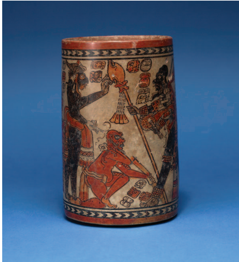
Polychrome cylinder Chama, Guatemala H: 23.5 cm; D: 15 cm 38-14-1

This frequently published vessel may illustrate the impending death of a local lord who defied a group of newcomers from a low-land city, some of whom observe his humiliation. The figure on the right in the rollout is identified as the “Chak Ahaw,” or young lord, a designation frequently used for the heir to the throne. The black-painted figures facing the kneeling victim may symbolize the Maya deities known as God L and God M, whose domain includes warfare, death, and protection of long-distance traders.