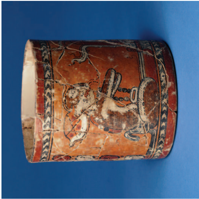
Chama polychrome cylinder: rabbit and fragmentary figure Chama, Guatemala H: 16.6 cm; D: 15 cm NAT1185 Rollout painting by M. Louise Baker

Costume and masking are important elements among the Maya today, as they were in antiquity. Here an individual is costumed to represent a rabbit, identified in other contexts as the scribe of the gods. The fragmentary nature of the vessel allows only a hint of the lost figure on the other side of the offering basket: part of a plumed headdress, three fingers in a graceful gesture, an elbow and knee with the markings of one of the Hero Twins. Is this part of an unknown episode in the Popol Vuh ? A negotiation between two costumed rulers? The enigmatic scene still defies explanation.