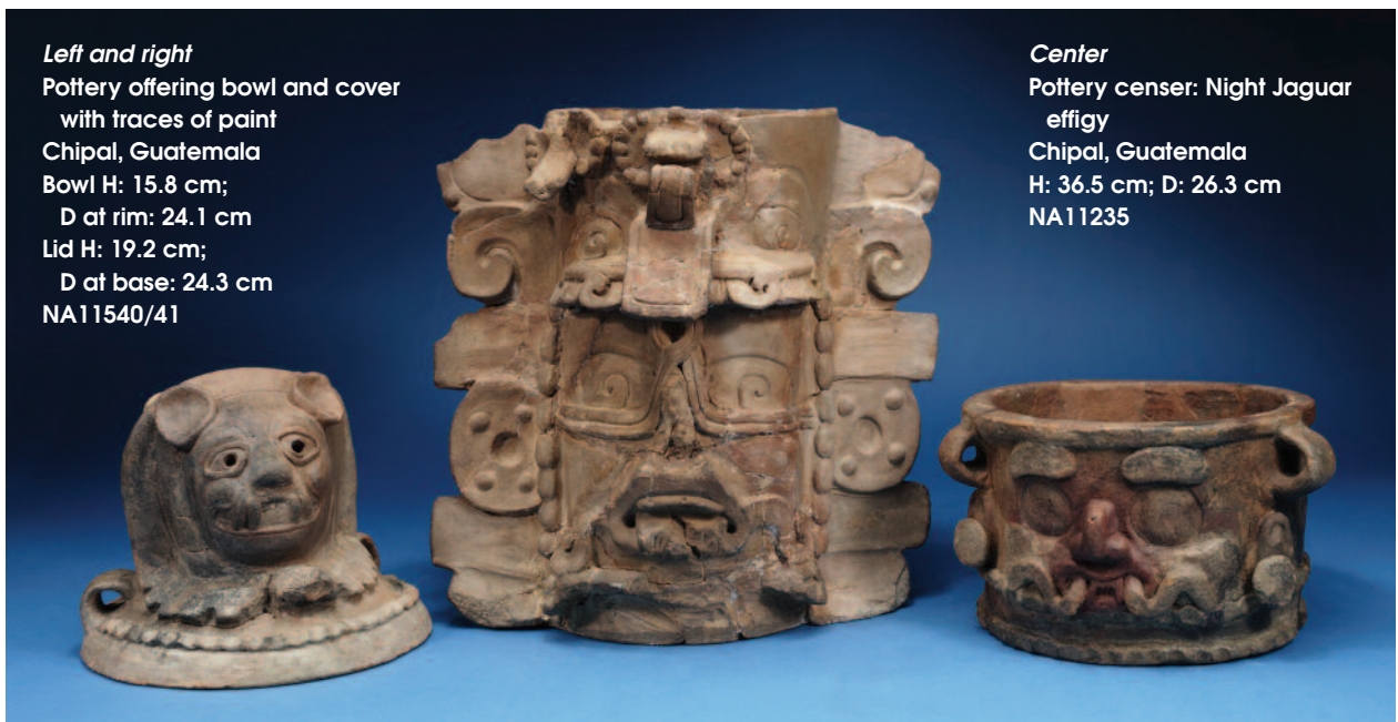
Left and right Pottery offering bowl and cover with traces of paint Chipal, Guatemala Bowl H: 15.8 cm; D at rim: 24.1 cm Lid H: 19.2 cm; D at base: 24.3 cm NA11540/41

Rituals have always commemorated important events in the life of the family and the community. Such rituals involved censers and offering bowls, frequently decorated with deity effigies. The figure of the jaguar, largest and most feared predator in Central America, was seen as a manifestation of both the Sun God and the sun at night, called the Jaguar God of the Underworld. The face on the bowl is that of God G1, one of the manifestations of the Sun God, while the lid is molded in the form of a double jaguar head. The combination of bowl and lid may have been considered as a particularly powerful vehicle for making offerings. The tall censer bears the face of the Jaguar God of the Underworld, identified by the “cruller” line that curls beneath his eyes and twists above the bridge of his nose. The style is reminiscent of censers from the region of Palenque, and may have been imported or made locally using distant models.