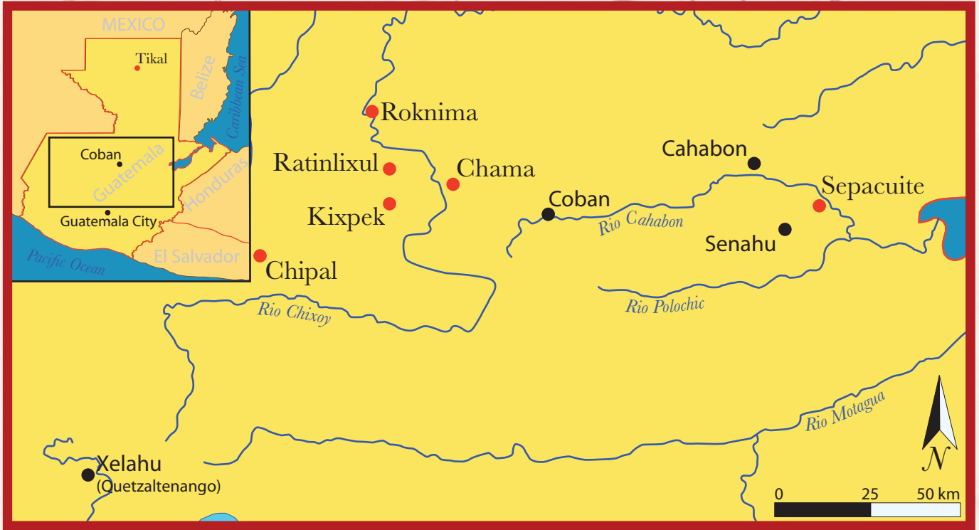
Detail of map of Guatemala highlighting the sites mentioned in the exhibition. The red dots indicate Late Classic sites. (Map by William R. Fitts)