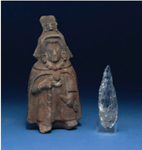
Pottery figurine (whistle): courtier with staff and ceremonial blade Chipal, Guatemala H: 18.415 cm NA11352 Crystal blade Chipal, Guatemala L: 10.1 cm NA11465

Elite groups, even in such out-of-the-way regions as the Chixoy River Valley, marked their elevated status with elegant clothing, ceremonial weapons, and jade or obsidian beads and pendants, such as those shown below on the right and indicated on the figurine. In his role as shaman, a ruler might have used the translucent qualities of the crystal blade for divining.