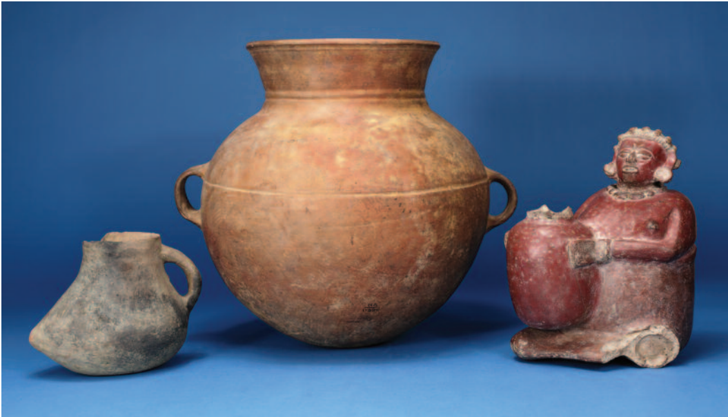
Left Pottery shoe pot Chipal, Guatemala H: 14.61 cm; L: 20.3 cm NA11511

Although the Chama polychromes seen on the preceding pages mark a change in pottery tradition, heralding a change in rulership, there seems to be no break in the materials and lives of the ordinary people of the Chixoy Valley, suggesting that the incursion was relatively peaceful. Cooking pots, the ubiquitous ollas , were made as they always had been; the one shown below is the classic large Mesoamerican olla . The figurine on the right holds another version. The practical “duck” or “shoe” pot is found throughout Mesoamerica. The toe of the food-filled vessel would be placed in the hot coals. When the food was cooked, the still cool handle allowed for easy removal.