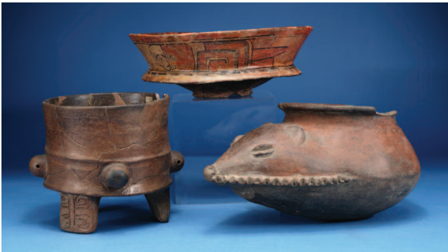
Left Pottery cylinder with 3 slab feet Chama, Guatemala H: 17.145 cm NA11175

The pottery in which feast foods were served was no less elaborate than the food itself. Macaws are frequent decorative images, recalling an episode in the Popol Vuh , the highland Maya creation myth, in which the Hero Twins use their blowguns to attack and best the pompous false god named Seven Macaw. The vessels themselves are sometimes given fanciful form. The ubiquitous “duck pot” used for cooking is here elaborated into a rodent shape that more resembles a shoe (see p. 55), and would have been used as elite ware. A relationship with the powerful city of Teotihuacan is suggested by the presence of the slab-footed cylinder vessel, the iconic pottery shape of that all-important central Mexican site. Such a connection would add to the prestige of the local elites.