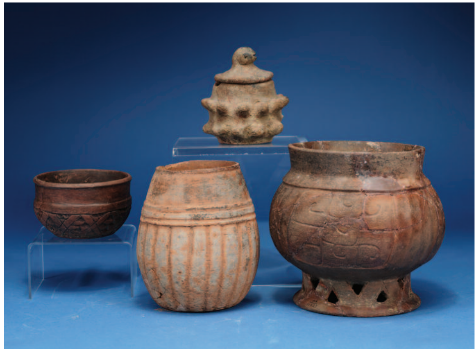
Right Pottery bowl with lattice ring foot Chama, Guatemala H: 15.9 cm; D: 19.1 cm NA11227