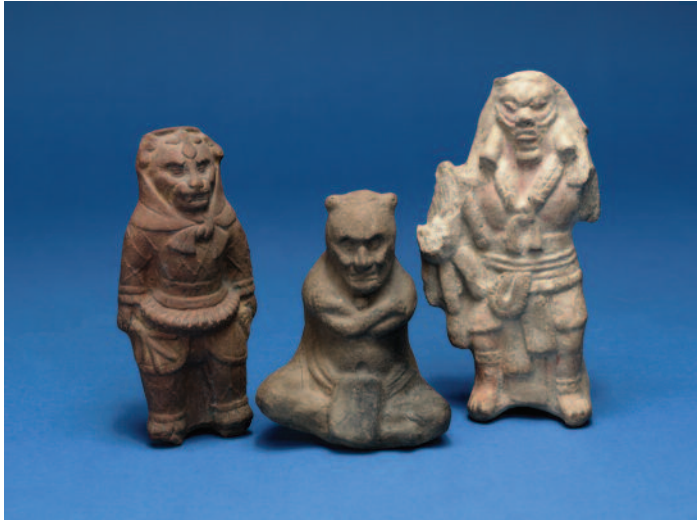
Left Pottery figurine (whistle): shaman transformed into a jaguar Chama, Guatemala H: 12.7 cm NA11208

Shamans mediated between this world and the supernatural through a unique ability to speak directly with the deities who controlled the Maya universe. Many Maya figurines were also whistles or ocarinas, used to call the spirits. Shamans were believed to have the power to transform themselves into their animal “spirit companion” ( way ). The figurine in the center is sunk deep in trance: jaguar ears atop his head and paws instead of hands foretell his complete transformation into something akin to the anthropoid jaguar on the left. The figurine on the right holds a baby jaguar, now more than half missing.