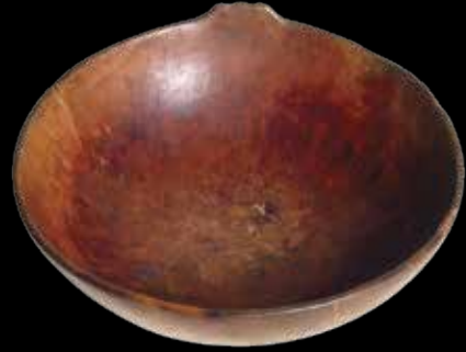
ABOVE: This wooden bowl, made from a burl (a rounded outgrowth filled with dormant buds), was returned as a sacred object to the Sac and Fox Tribe of Mississippi in Iowa. Their ancestor spirits are said to dwell in the trees, and burl bowls are needed for ongoing religious practices associated with fertility and hope for the future. UPM object #29-48-301.