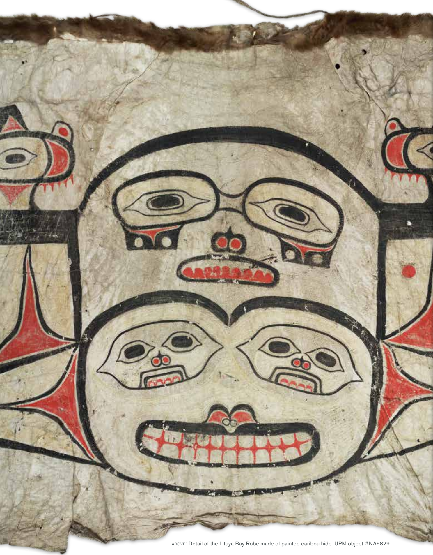
ABOVE: Detail of the Lituya Bay Robe made of painted caribou hide. UPM object #NA6829.