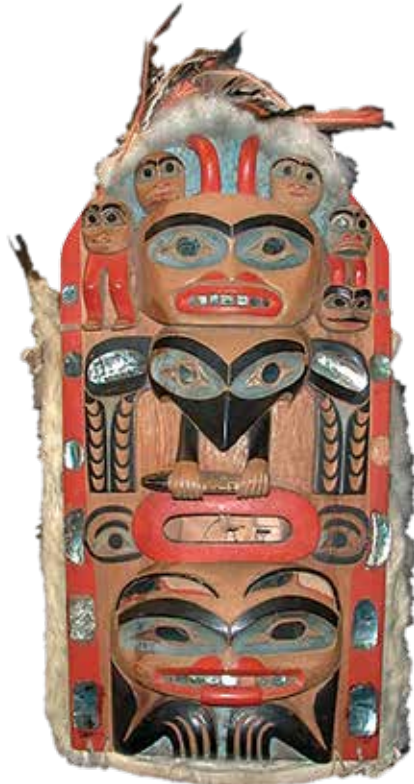
ABOVE: The Ravine Frontlet Headdress was returned to the T'akdeintaan Tlingit of Hoonah, Alaska in 2011. Carved of wood, the hat expresses the clan's relationship to Mt. Fairweather. W. 22 cm. UPM object #NA6835.

In 2010, the University Trustees agreed to return clan objects and establish a partnership with the Tlingit Kaagwaantaan and L'ooknax.ádi clans of Sitka, Alaska. Although all requirements of the law were not met, the University found that eight of eleven objects in this instance were needed and of central importance to the clans. Again, in recognition of the historical significance of three remaining objects, the University proposed a joint arrangement to send the objects to Alaska where they would be available to the clans. The clan leaders accepted this proposal. However, a second Kaagwaantaan clan leader, through another federally recognized Alaskan entity, made a competing claim for the Kaagwaantaan objects. After careful consideration, Penn was unable to make a determination regarding which leader is the rightful claimant and asked the Kaagwaantaan to determine this among themselves. As of this writing, this case has not yet been resolved.