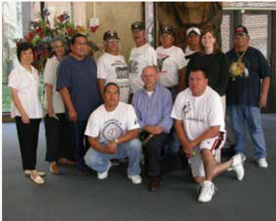
ABOVE: The Sisseton Wahpeton Oyate of South Dakota repatriated the documented human remains of a warrior who lived in the 1820s.