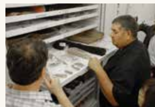
ABOVE: Eastern Band of Cherokee of North Carolina consultants reviewed the Museum's strong ethnographic collections in storage.