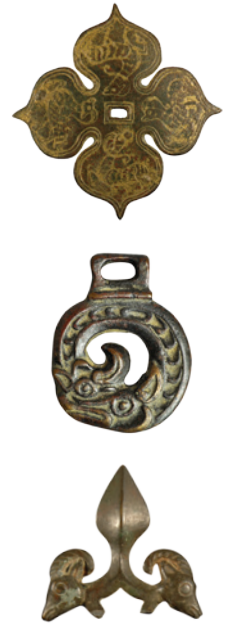
ABOVE: Examples of the diverse bronze ornaments found in the Mayer Collection. PM objects (from top to bottom) 41-37-278, 41-37-365, and 41-37-378A.

At the time, an interest in small bronze artifacts from China’s northern frontier regions flourished in Beijing among private collectors for whom the more spectacular bronzes, sculptures, and paintings were out of reach. Bronzes of this type are often referred to as “Ordos” or “northern zone” bronzes. One of the reasons for their popularity was a renewed interest in the Scythians, an Iranian nomadic group inhabiting the Eurasian steppes between the 7th and the 4th centuries BCE. Documented discoveries of Scythian objects, magnificently wrought in gold and silver with a distinctive “animal-style,” began in southern Russia in 1763. In the 19th and 20th centuries, many similar forms were found in the vast steppe region extending from China to Eastern Europe. The so-called Maikop Treasure from the Crimea, a portion of which