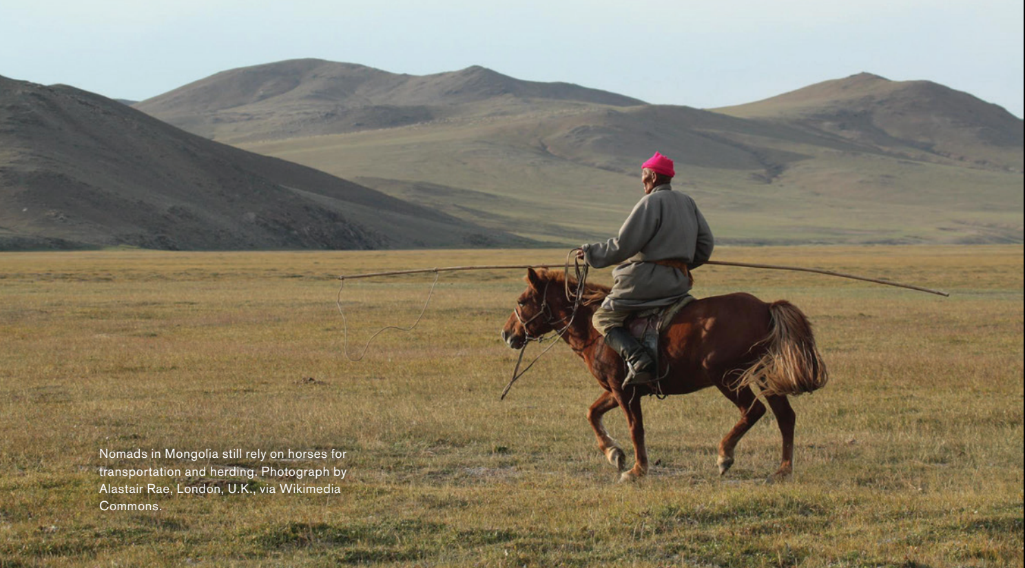
Nomads in Mongolia still rely on horses for transportation and herding.