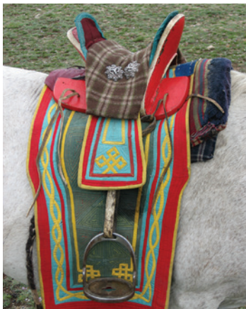
ABOVE: Modern Mongolian horse tack is highly decorated, with design motifs similar to those found in the Mayer Collection.