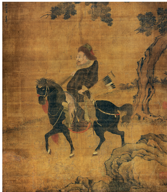
ABOVE: Yuan style painting in ink and muted color on silk. A fur-clad, leather booted Tartar horseman is depicted here on a small Mongolian pony returning from a winter hunt with a slain deer and a large bird slung over the saddle. Ornaments examined by the author may have decorated the tack of horses like this. PM object C448.