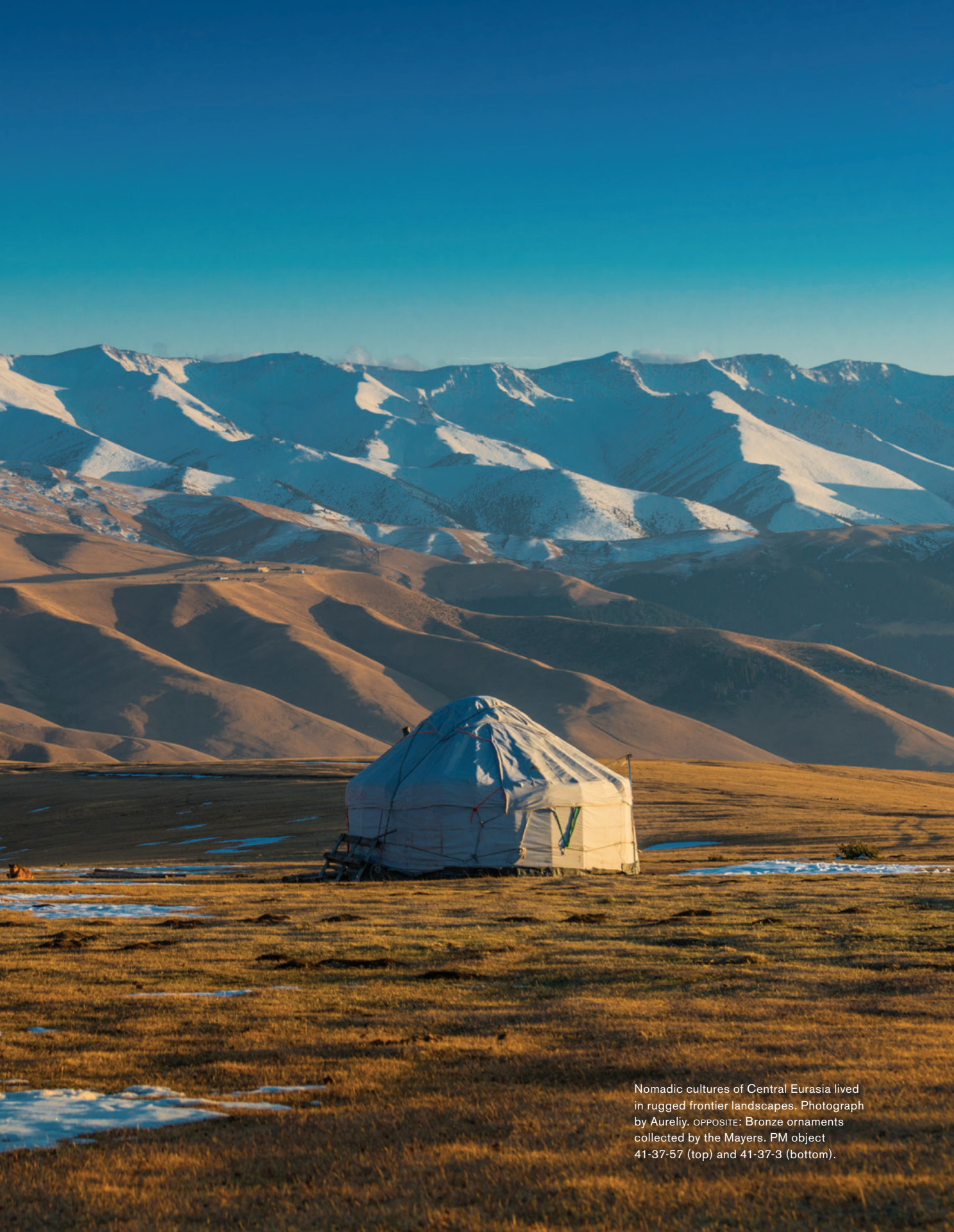
Nomadic cultures of Central Eurasia lived in rugged frontier landscapes. OPPOSITE: Bronze ornaments collected by the Mayers. PM object 41-37-57 (top) and 41-37-3 (bottom).