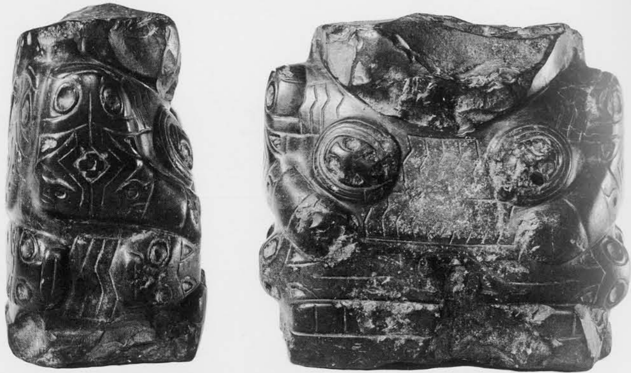
Seated stone figure with head broken off. Height 29¼ inches as shown; maximum thickness 4½ inches.

ruins in both Bolivia and southern Peru. In detail, however, it has none of the distinctive traits of Classic Tiahuanaco design, which are easily recognizable. Starting at the top, the headband with its concentric diamond pattern I cannot duplicate, but the headband is found in many statues in the Titicaca area. The eyes are also suggestive of the staring eyes of many Peruvian specimens, but again I cannot find exact duplicates. There are some examples of a rounded oblong eye from the Province of Puno, on the northern and western side of Lake Titicaca, but none as relatively long and flattened. The nose, linked with the eyebrows, recalls similar treatment in both Peru and Bolivia, and the marked flaring of the nostrils is not uncommon. The mouth, again a rounded oblong, has teeth that resemble those in Tiahuanaco design, but they lack the stylized depiction of canine teeth so characteristic of Tiahuanaco style. In the Titicaca region teeth are not usually shown in full face sculpture, which makes this example unusual in itself. There is, however, one example from a site not far south of Tiahuanaco which, while otherwise typically Classic Tiahuanaco in style, has a rounded oblong mouth. The only difference between the mouth of this head (the "Gigantic Head" of A. Posnansky, now in the outdoor museum of Tiahuanaco sculpture in La