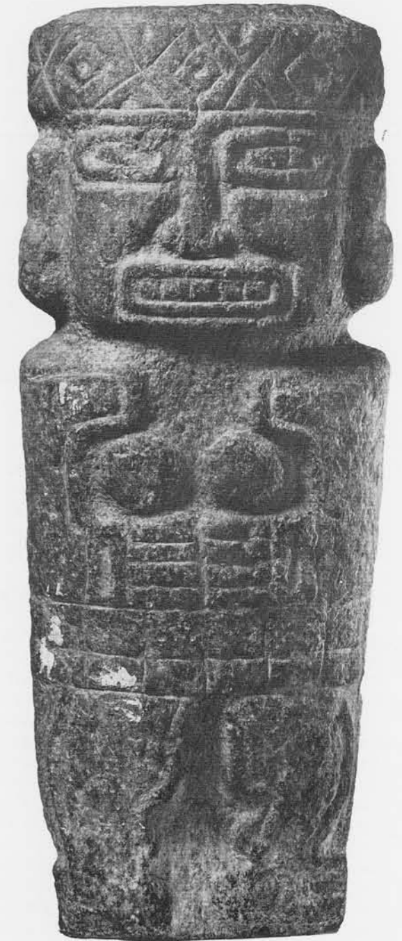
Stone statue of unknown origin, possibly from Bolivia. Height 29 1/4 inches as shown.

The stone itself tells us nothing. It is a dark gray, coarse stone that looks like a schist (it has not been identified by a geologist). I do not recall having seen its equal among the many sculptures I have examined in Bolivia and Peru, most of which are of sandstone or basalt. The back is uncarved and only roughly smoothed. The base, which is not visible in the photograph, provides only about two or three inches extra length for setting the figure upright, but this is sufficient for the purpose of so doing. One aspect of the treatment of the human figure as a whole is its blockiness which is characteristic of the sculpture of the great Bolivian site of Tiahuanaco and related