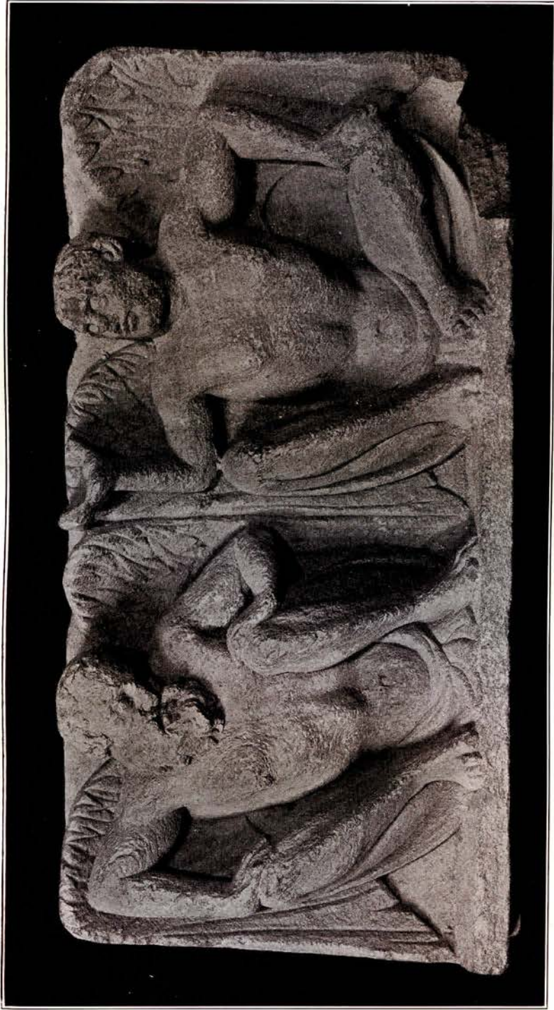
Group of Sculpture, Gandhara. Size 6 x 11½ inches.