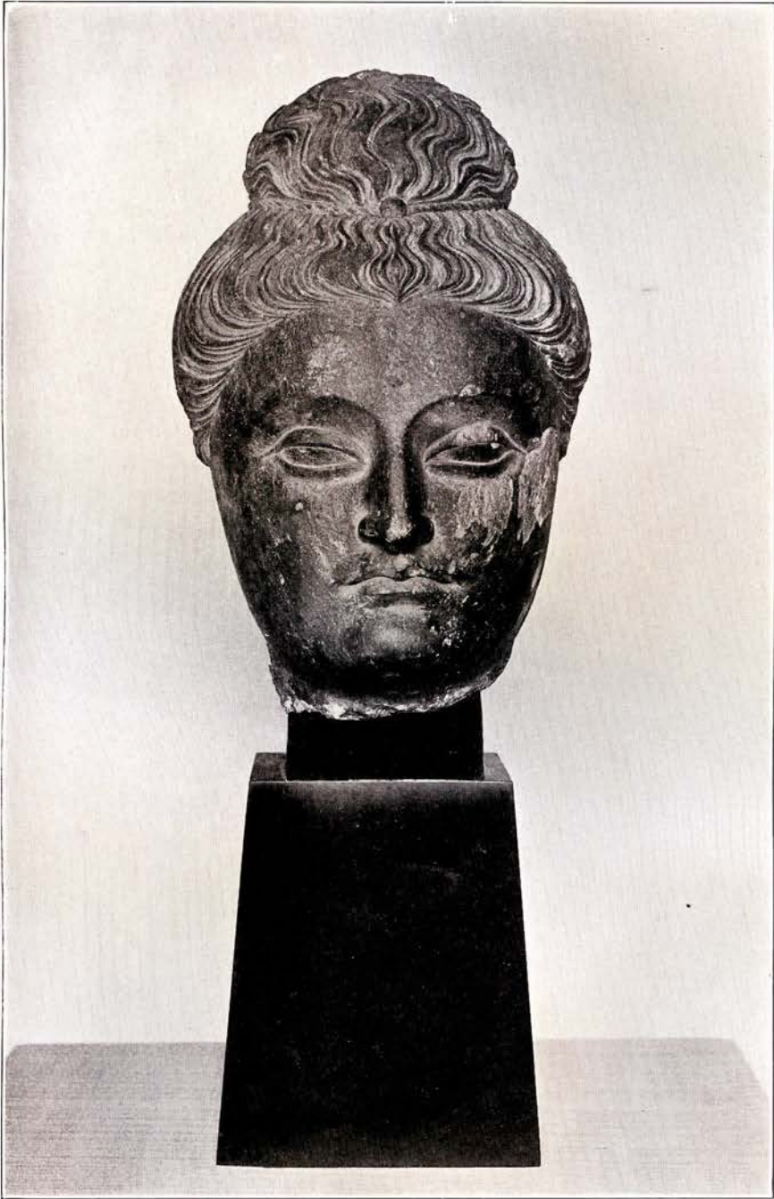
Head of the Buddha. Gandhara.