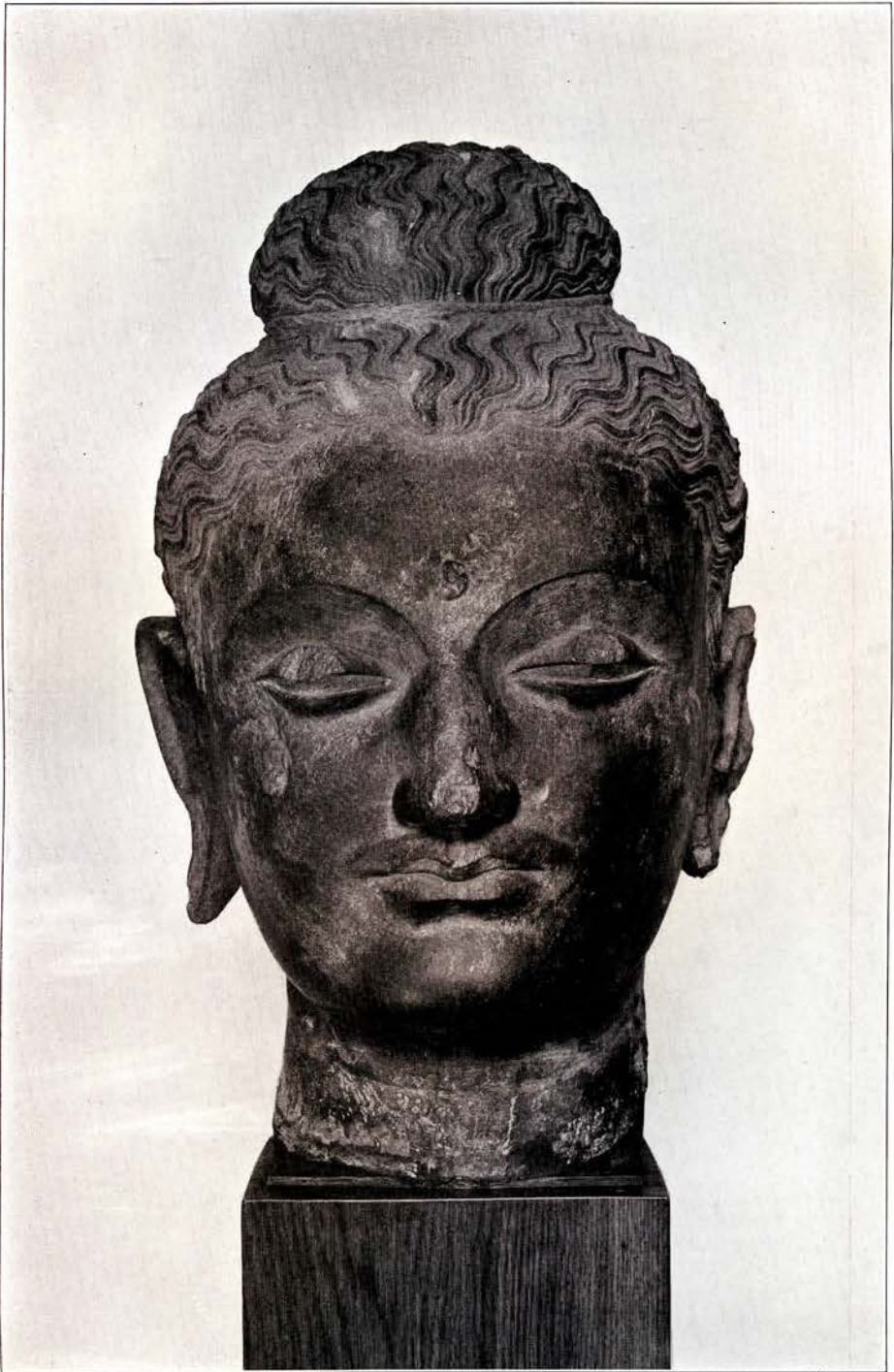
Head of the Buddha. Gandhara. Height 20 inches.