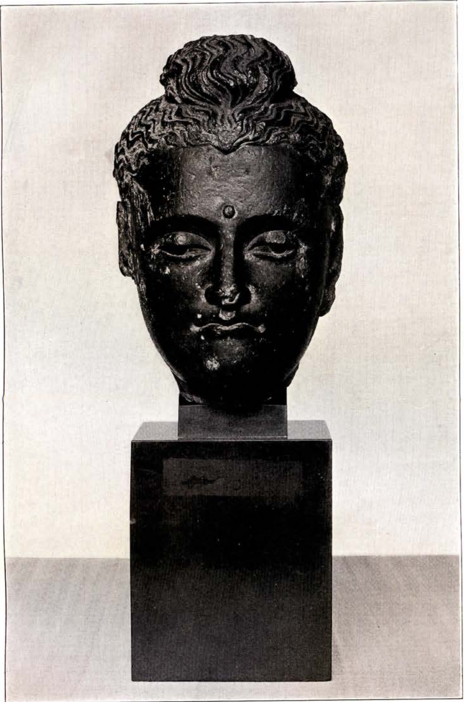
Head of the Buddha. Gandhara. Height 9 inches.