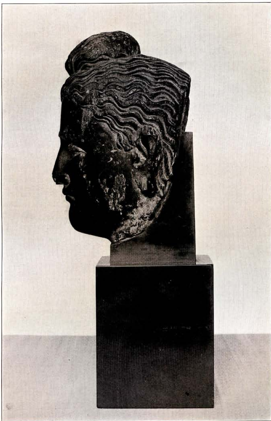
Profile. Head of Buddha shown in Plate XXI.